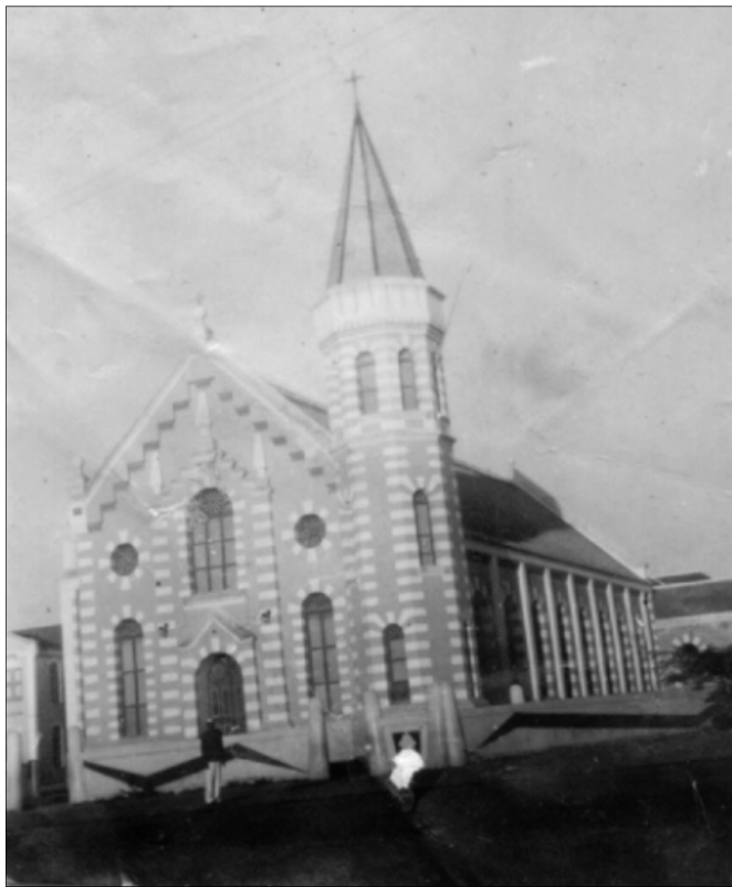
Santa Cruz Church—circa 1940