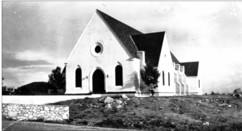
Lago Community Church - circa 1937

went to Nottingham Academy, a prep school in Maryland. There was just the two of us and my mother, and we still had two maids. We didn't need them, but they were part of the family by that time.