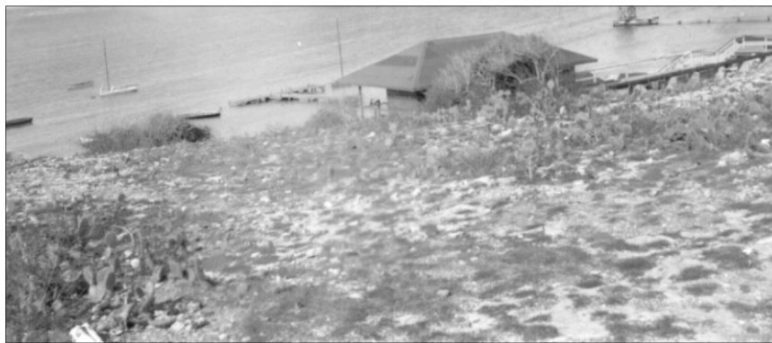
T-Docks--Yacht Club--Rodger's Beach circa 1930-1940